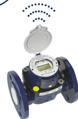
MEISTREAM CONNECT by SENSUS