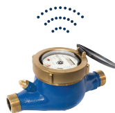
MVCONNECT by Madey Vered